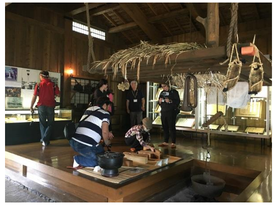
Old Shimamatsu Communication Station